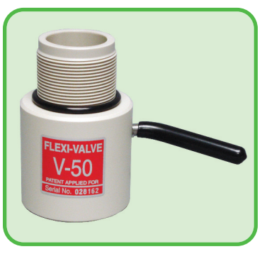
IC-2036 / IC-2037 V50 Valve / 2" BSP Adapter / Cutter Pusher