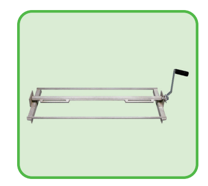
IC-9045 45" Winder System