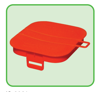
IC-9061 Tamper Evident Hatch Caps