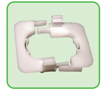
IC-9056 CDF Gland Adapter