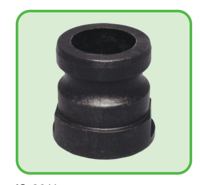
IC-9011 2" Butterfly Valve Cam Adapter