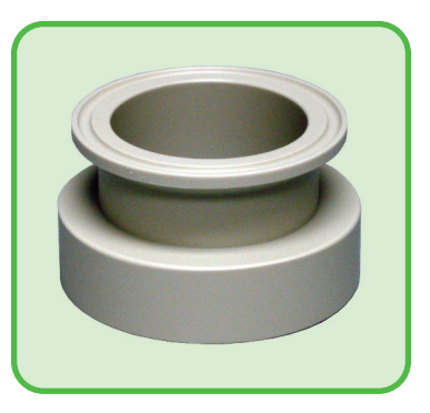
IC-9018 S60 Female / 2" Tri-Clamp Adapter