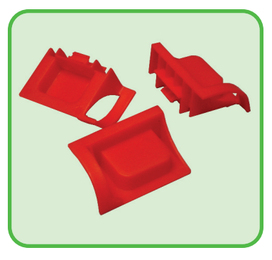
IC-9060 Red Lid Seal Clips (Kit)