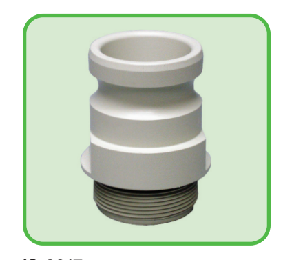
IC-9017 2" Male BSP / Cam Adapter