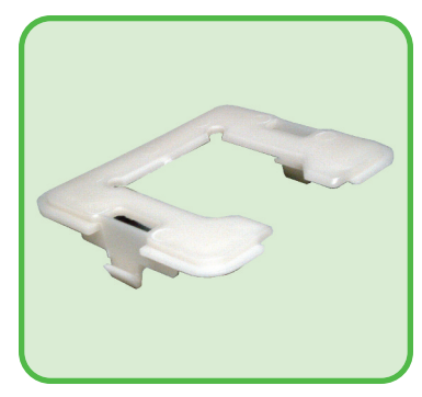
IC-9012 2" Combo Clip