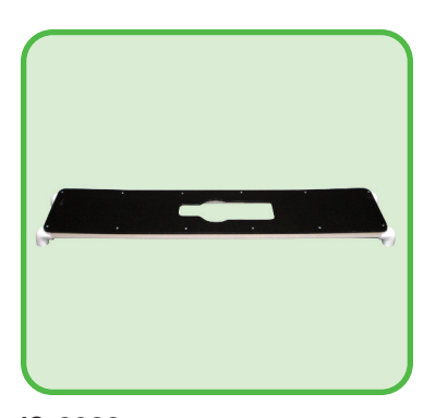
IC-9022 PVC Universal Fill Bridge