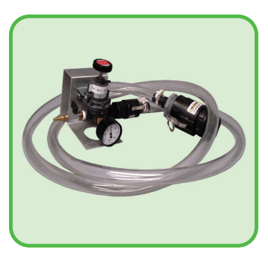
IC-9133 Air-Assist Venturi System