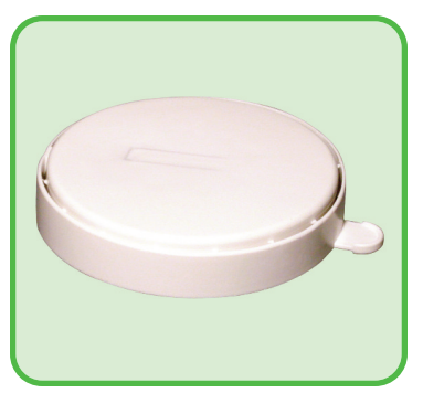
IC-2046 2" Push Lock Cap