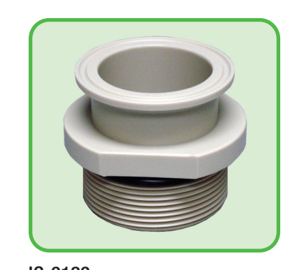
2" BSP Male / 2" Tri-Clamp Adapter

CDF warrants that its products will be free from defects in material and workmanship for one-hundred eighty (180) days after the date of delivery. Warranty claims must be made in writing no later than five (5) business days after the expiration of the warranty period. CDF's obligations under this warranty are limited solely to replacement of such products as are proven to be defective after CDF's inspection. Prior to use, the user shall independently determine the suitability of the products for the user's intended use and user assumes all risk and liability whatsoever in connection therewith. CDF products are intended for single use application. Any reuse of the liner and/or fitment voids this warranty.