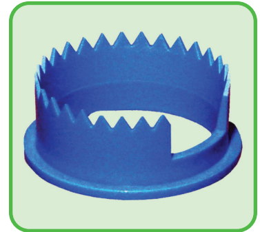
IC-2055 2" Cutter