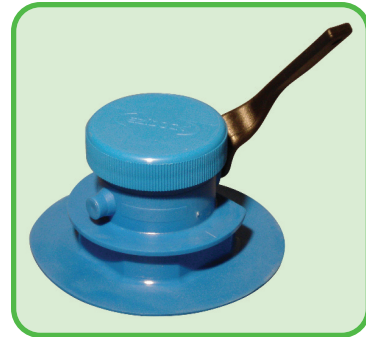
IC-2008 2" Butterfly Valve