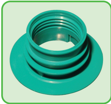
IC-2005 2" Buttruss Gland