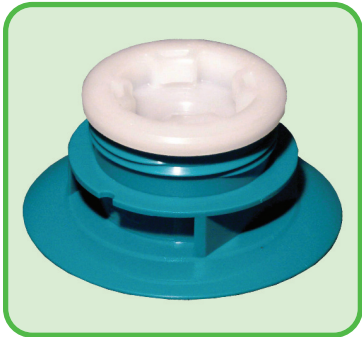
IC-2018 / IC-2043 2" BSP with Shouldered Plug