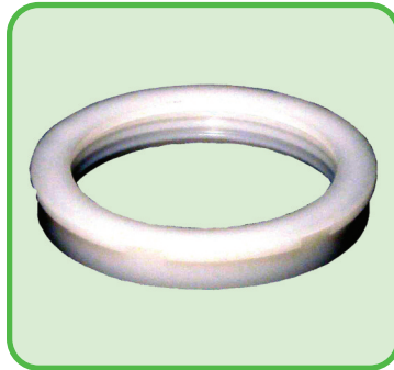
IC-2010 2" Locking Collar