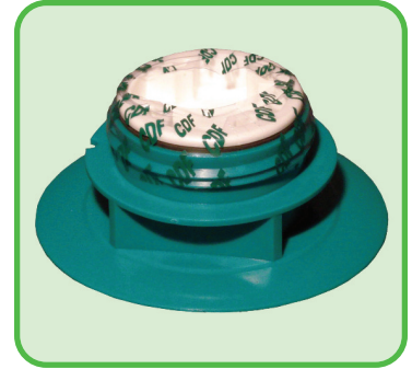
IC-2018 / IC-2009 / IC-9006 2" BSP with Non Shouldered Plug & Tamper Sleeve