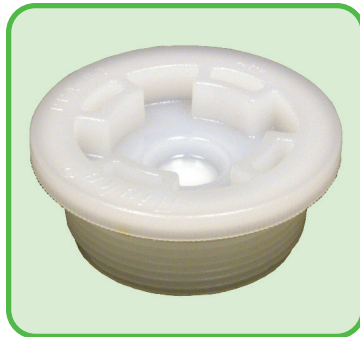
IC-2043 2" BSP Plug, Shouldered