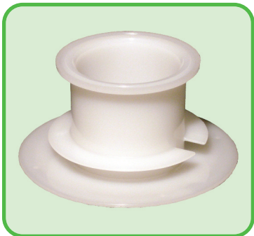
IC-2060 2" Tri-Clover

CDF warrants that its products will be free from defects in material and workmanship for one-hundred eighty (180) days after the date of delivery. Warranty claims must be made in writing no later than five (5) business days after the expiration of the warranty period. CDF's obligations under this warranty are limited solely to replacement of such products as are proven to be defective after CDF's inspection. Prior to use, the user shall independently determine the suitability of the products for the user's intended use and user assumes all risk and liability whatsoever in connection therewith. CDF products are intended for single use application. Any reuse of the liner and/or fitment voids this warranty.