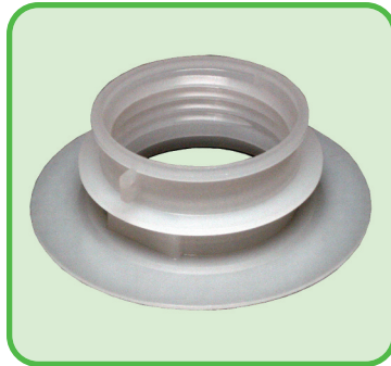
IC-2042 2" Short Buttruss