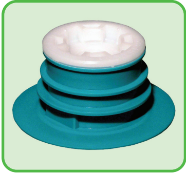
IC-2005 / IC-2044 2" Buttruss with Plug