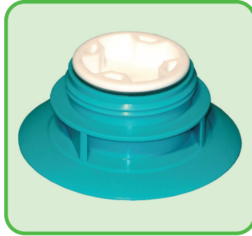
IC-2018 / IC-2009 2" BSP with Non Shouldered Plug