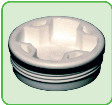
IC-2009 2" BSP Plug, Non Shouldered