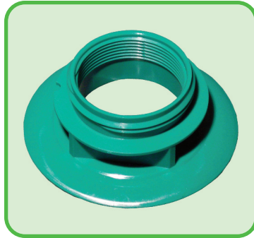
IC-2018 2" BSP Gland