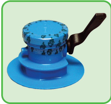
IC-2075 2" Extended Butterfly Valve