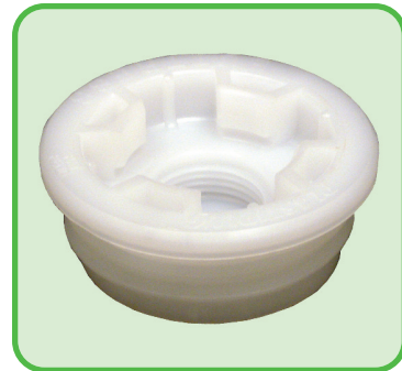
IC-2044 2" Buttruss Plug