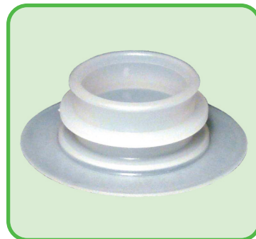
IC-7001 902 Low Spout