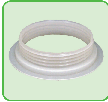
IC-6003 6" Buttruss Gland

CDF warrants that its products will be free from defects in material and workmanship for one-hundred eighty (180) days after the date of delivery. Warranty claims must be made in writing no later than five (5) business days after the expiration of the warranty period. CDF's obligations under this warranty are limited solely to replacement of such products as are proven to be defective after CDF's inspection. Prior to use, the user shall independently determine the suitability of the products for the user's intended use and user assumes all risk and liability whatsoever in connection therewith. CDF products are intended for single use application. Any reuse of the liner and/or fitment voids this warranty.