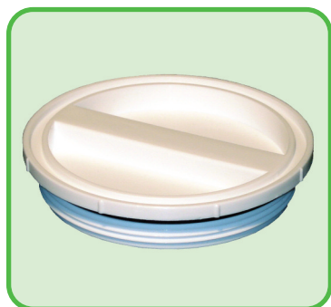
IC-3025 3" BSP Plug