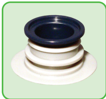
IC-1007 1" Aseptic, SL