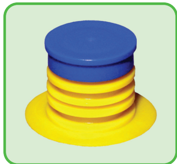
IC-1003 1" Aseptic, K