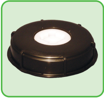
IC-6005 6" Buttruss Cap