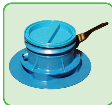
IC-3104 3" Butterfly Valve